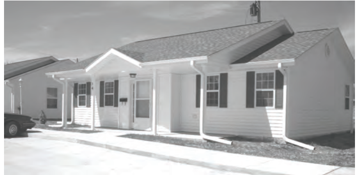
Meadowview Senior complex provides affordable and safe housing in the Jamesport community.

Meadowview has 10 one-bedroom apartment units in three buildings and four stand-alone cottages. It has a landscaped picnic and outdoor area, a community room and a parking area for all residents; and a laundry facility for residents living in the apartments. The apartments and cottages are equipped with new, energy-efficient stoves, refrigerators and mi-