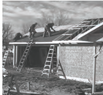
A construction crew works on a new home in Hamilton.

nearly finished with a three-bedroom, two-bath house at 703 N. Ritchie St. When it is completed, the crew will build a two-bedroom, one-bath cot-